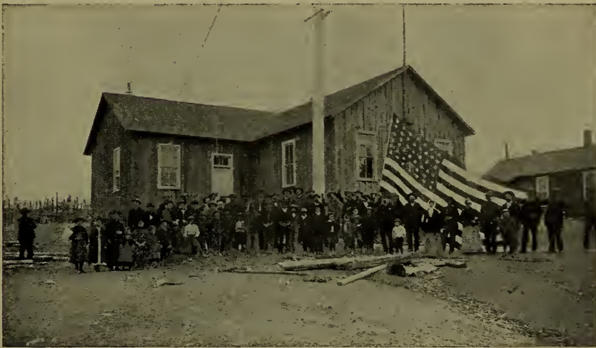
A FLAG RAISING ON THE CONTINENTAL DIVIDE.